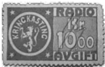
The license mark from 1925 to 1941.

In the chart, the blue line signifies number of payees for the broadcasting license due to having a radio, which ceased to be a reason to pay the license in 1976. The broadcasting license on Television was introduced in 1957. The red line signifies black and white television receivers, and the green line the number of licenses for color-TV.